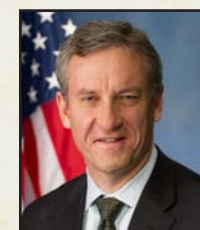
Congressman Matt Cartwright (CD8 D)