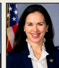
Rep. Bridget Kosierowski (HD114 D)