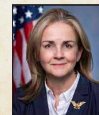
Congresswoman Madeleine Dean (CD4 D)