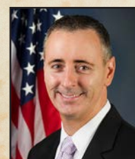
Congressman Brian Fitzpatrick (CD1 R)