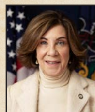
Sen. Pam Iovino (SD37 D)